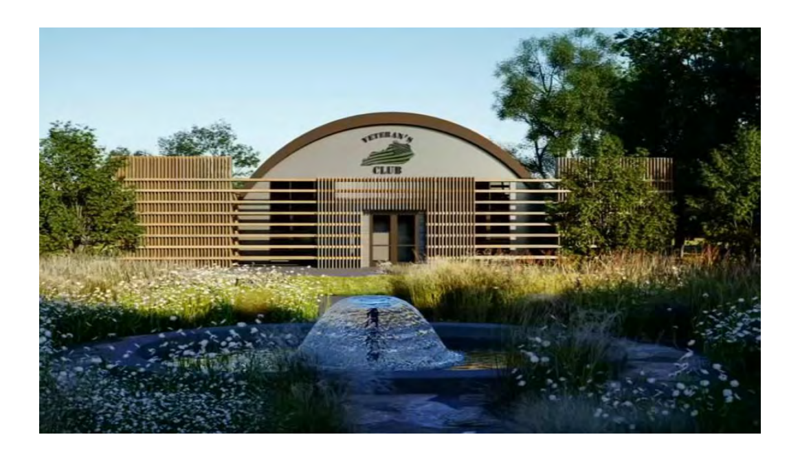
The community is an effort by the Kentucky Veteran's Club.