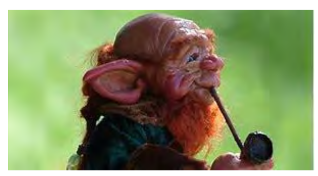
The Carlingford Leprechauns: Protected by the European Union, But are they real?